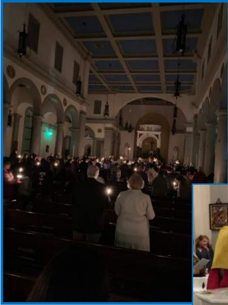
The Great Easter Vigil April 20