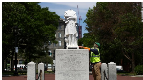
(Statute of Christopher Columbus beheaded in Boston, June 2020)